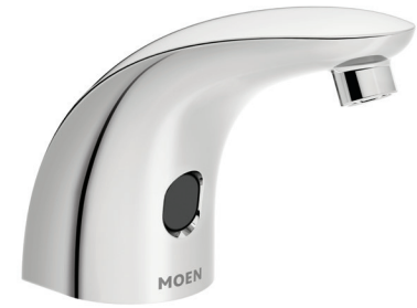
M•Power™ Transitional Style Electronic Soap Dispenser